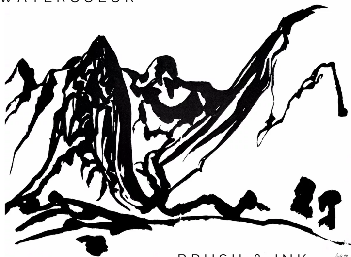
BRUSH & INK