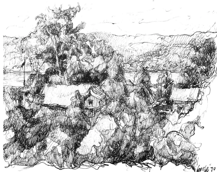
PEN & INK